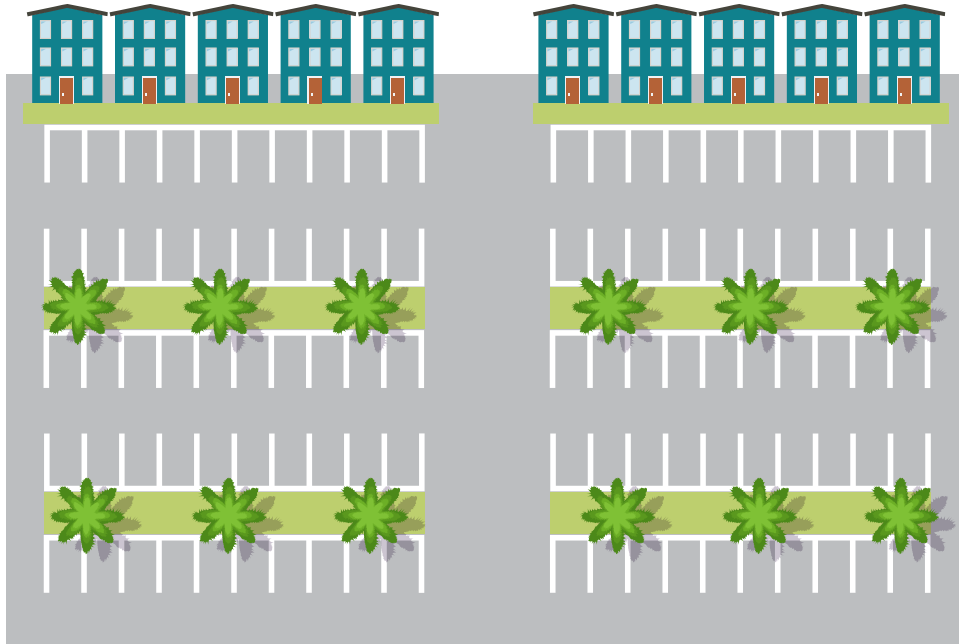
50 Housing Units and 100 parking spaces. Total Cost: $32.5M | Cost per Unit: $650K